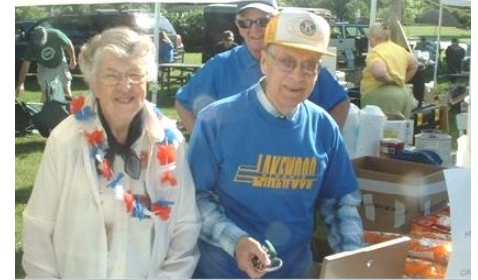
Two faithful dedicated workers....