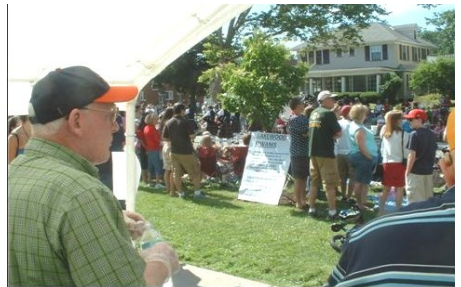
"Hey, the hot dogs are over here!"