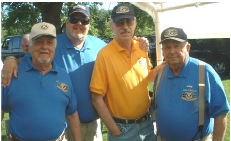
It's almost like Mt. Rushmore! – 4 Presidents,....well almost....